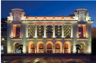
LE PALAIS DE MÉDITERRANÉE

2. OPTIONAL EXTENSION (FRENCH RIVIERA): November 17 - 20, 2011. Includes: 3 nights at the centrally located 5-star Le Palais de Méditerranée , hot buffet breakfast daily, flight from Geneva to Nice, France , guided tour of Nice, and one dinner. There are also optional excursions to Monte Carlo; Eze; Cannes; and Provence Countryside.