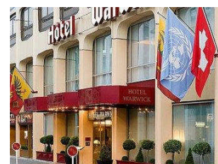
WARWICK HOTEL, GENEVA