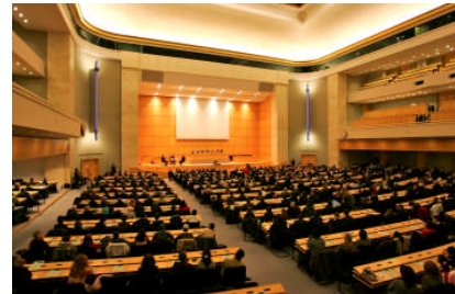
ASSEMBLY HALL, PALAIS DES NATIONS GENEVA, SWITZERLAND

MMG 2011 REGISTRATION. Registrations are good for one calendar year, and you must be registered in order to qualify for the concerts, hotels, trips, etc. More importantly, your membership will be a symbol of your partaking in the noble mission of this nationwide musical family. This mission of healing through music transcends many boundaries, and also – oceans! You may register online at www.medicalmusical.org , click on " Join ", or use the enclosed form. If you can, please make a financial contribution – every little but helps in this economy. We have posted the names of 2010 contributors: see www.medicalmusical.org , click on " Honor Roll ". Thank you all who made contributions already!