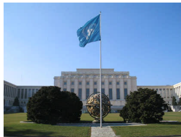
PALAIS DES NATIONS, UN EUROPE HEADQUARTERS, GENEVA